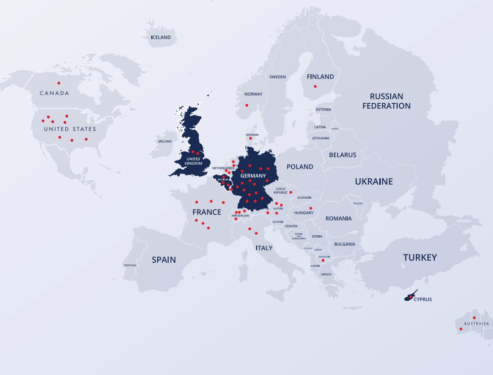
Election Coordination Center (SKM)

Turkish citizens living abroad have the legal right to vote at designated locations. AK Party has set up Overseas Election Coordination Center (SKM) in 21 Countries and 60 points during the elections for overseas electorate. Thousands of volunteers work for AK Party to campaign and promote participants in general elections and referendums.